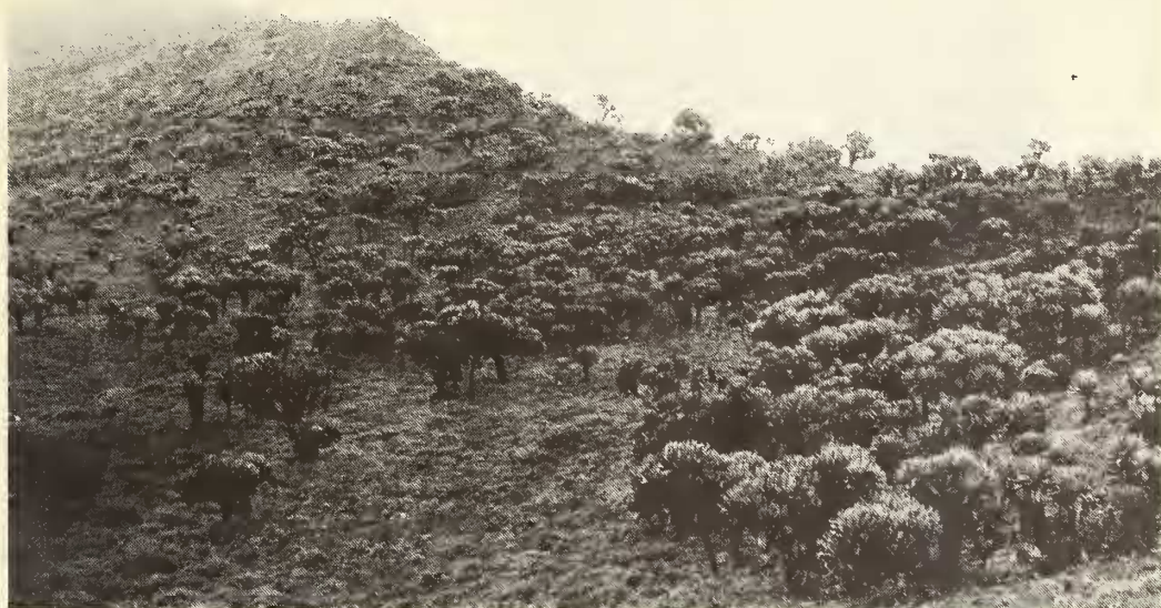
Fig. 4 Dendrosenecio woodlands: Dendrosenecio barbatipes -Community on the southeastern slopes of Lower Elgon at an elevation of 13,000 ft. The field layer consists predominantly of Alchemilla elgonensis (Foto: E. Beck, March 15th, 1983).